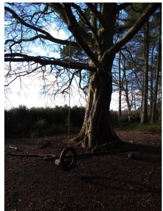
Mother of Beeches

Swings hang from two branches; insects and other invertebrates burrow into the soft core of the tree and make their homes. The woodpecker will soon come calling for her dinner, other birds will nest and shout from the canopy. I have found the Mother of Beeches, and of much else besides.